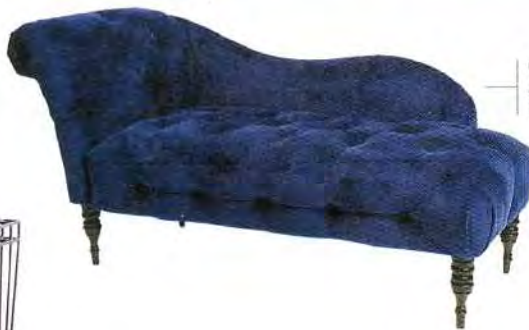
CURVY CHAISE A bedroom piece for lounging à la Mae West.