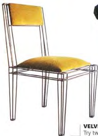
VELVET CHAIR Try two in an entryway, on either side of a modern console.