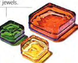
GLASS CONTAINERS Just the right size for necklaces, rings, and bracelets—jewels for your jewels.