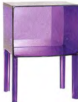
ACRYLIC NIGHTSTAND For a corner in the bathroom. Roll hand towels and tuck them inside.

Patterned wallpaper and drapes add grandeur to the sultry indulgence of an amethyst sofa and a midnight blue rug.