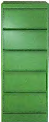
METAL CABINET Use it in the home office to stash supplies or in a playroom to hide toys.