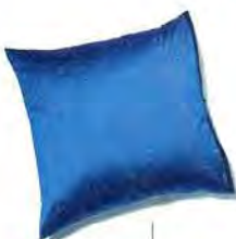
SILK PILLOW Surprising and rich tossed on a navy sofa.