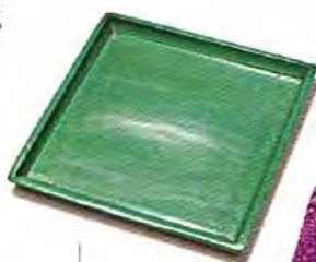
WEATHERED TRAY Picture it with Moroccan tea glasses filled with red wine.