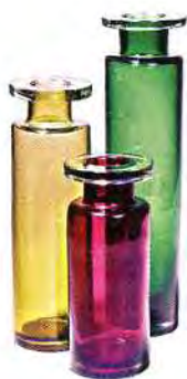
TALL BOTTLES Pretty in a sunny bathroom window—or on a holiday buffet, near votives.