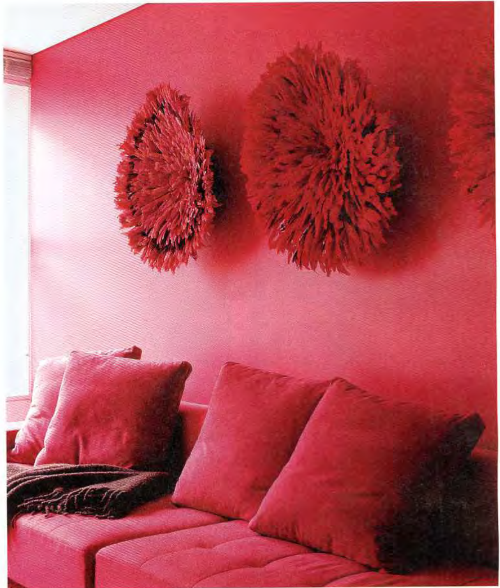
Natural light and a mix of textures soften a high-octane ruby-on-ruby scheme.

Next to painting a room black, there's nothing more arresting than covering walls in a jewel tone—it electrifies a space. But remember: The sheen dramatically affects the color. "A matte finish will take the edge out of a jewel tone and make it look dark and dry," says Washington, D.C., interior decorator Annie Elliott. On the other end of the spectrum, semigloss can look too "nightclub." To preserve the vibrancy without going overboard, stay in the middle with an eggshell finish.